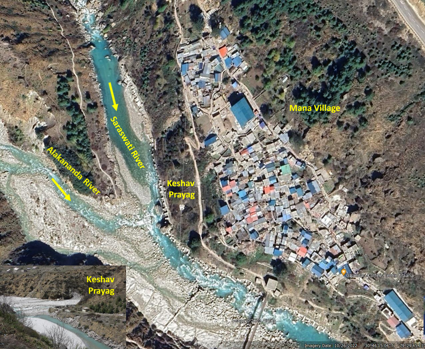
Land use pattern in Mana Village seen from Satellite Image , Badrinath