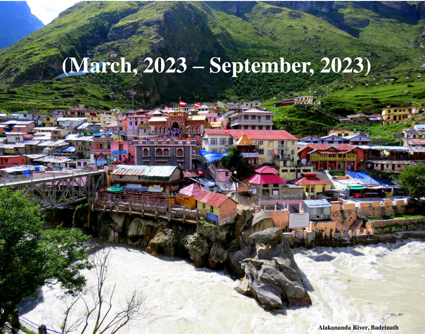
Alakananda River, Badrinath

Project Reference No.: F.No. 02/164/2021-22/ICSSR/MJ/RP