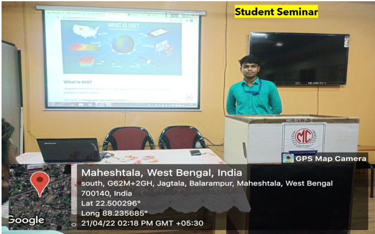
Room No – 17